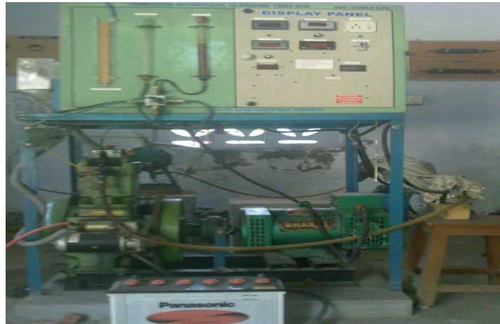
Fig 1 Experimental set up

The engine is run with various load conditions and the time taken for 10cc fuel consumption is measured. The engine set up is shown in Fig 1 and the loading is done by with electrical loading setup.